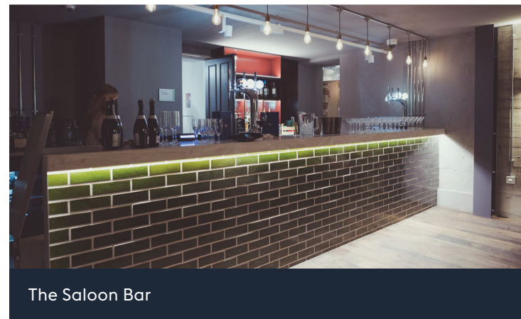
The Saloon Bar