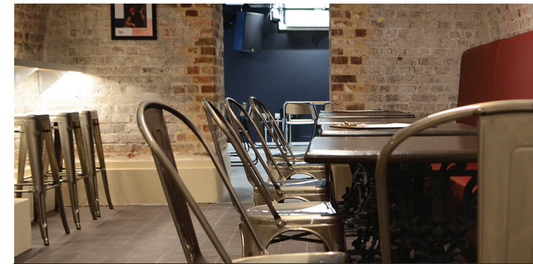
The Mermaid Tunnel