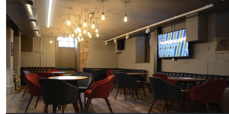
The Saloon Bar