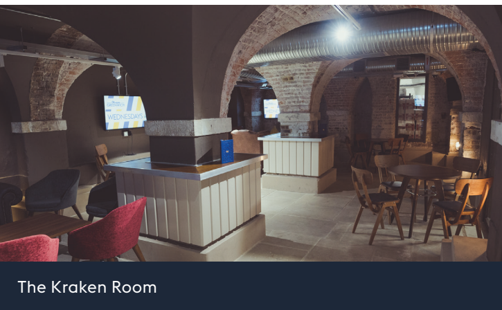
The Kraken Room